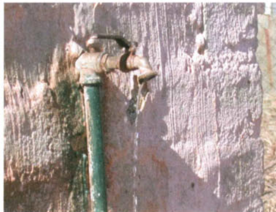
In 2012 the largest leakage assessment to date was undertaken in South Africa.