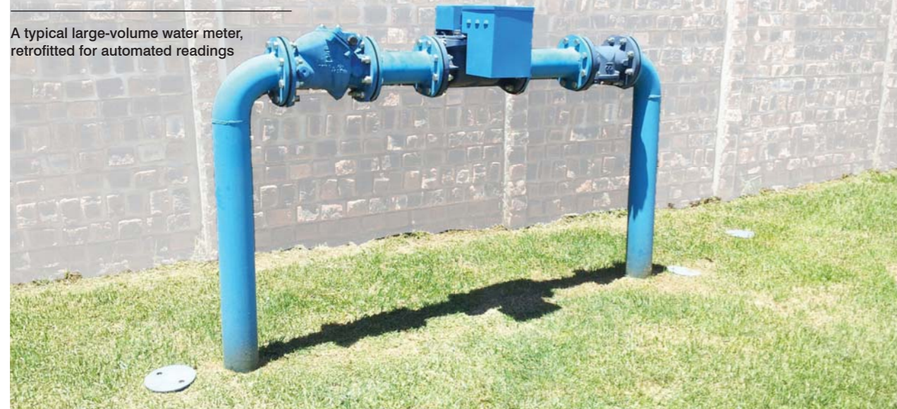
A typical large-volume water meter, retrofitted for automated readings

Water AMR is the technology of automatically collecting consumption, diagnostic, and status data from water meters and transferring