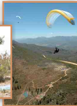
... and in mid-flight