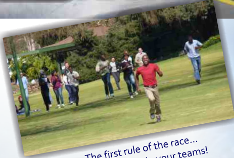
The first rule of the race... STAY together in your teams!