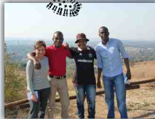
Even had time to pose for a photo