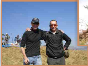
Pictured here with the world paragliding champ (On the right!)